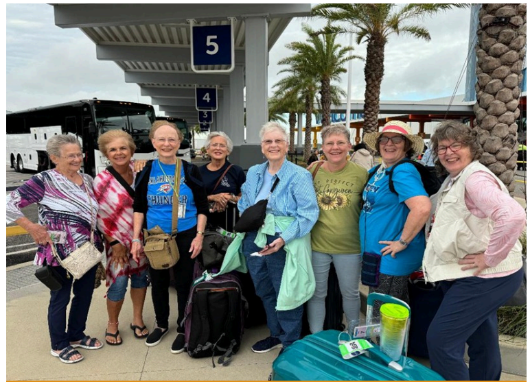
Members of the SH LAL Group ready to set sail

We finally sailed on September 30th. Our journey was extraordinary! We became the talk of the ship when all 8 of us wore our hot pink cruise t-shirts. We laughed, we worshipped, and we made memories that will last a lifetime. If you have lost your spouse by death or divorce, join us as together we learn how to have a new life after a loss. You will be blessed!